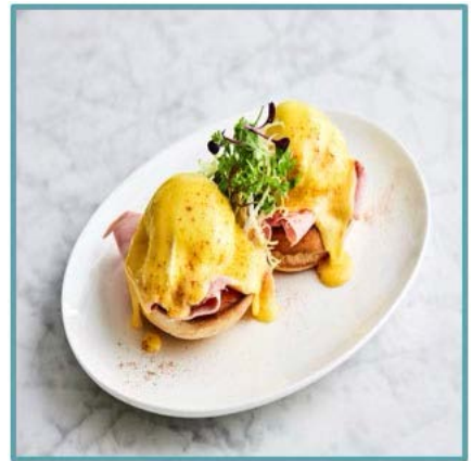
Further Prepared Food Processing

Our purchasing activities are highly concentrated. The vast majority of our purchases fall under two categories: eggs and packaging material. Municipal utilities and government agencies, subject to extensive government regulations, each contribute approximately 1%. In total, approximately 90% of our purchases are sourced from this concentrated group of vendors.